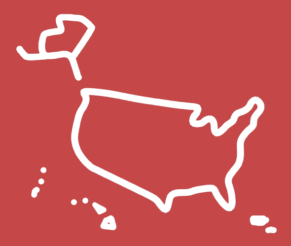
By 2020, Healthy Teen Network will work in all 50 states, US territories, and the District of Columbia to build the capacity of youth-supporting professionals to empower young people to thrive.